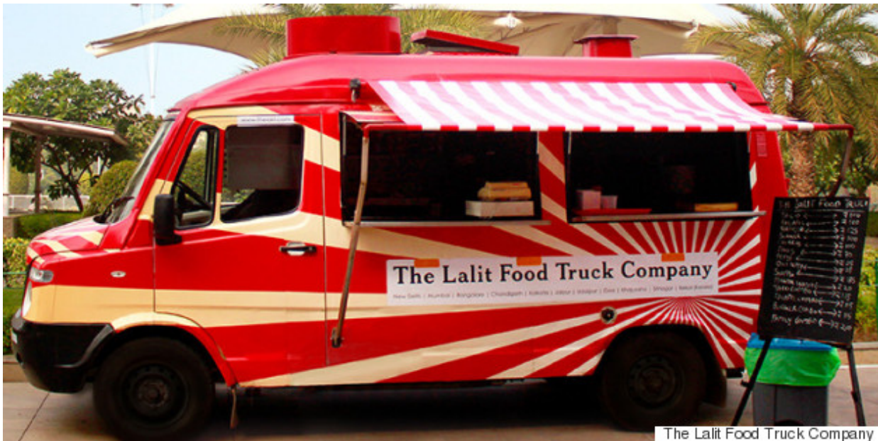
The Lalit Food Truck Company

Can we just start by stating the obvious; we know food trucks are meant to be mobile, and drive around serving food. Authentic or not, {read 'mobile or not'}, Delhi seems to have a sudden influx of the food truck concept. Although most of them don't really travel extensively, we're thinking as long as its on four wheels, it counts.